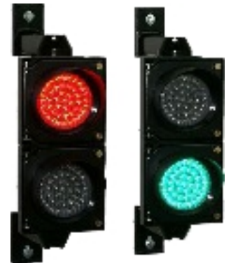
Optional Traffic lights